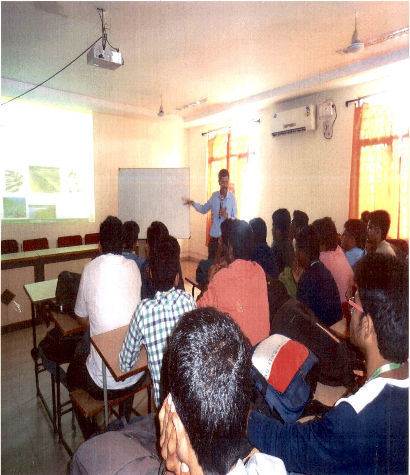
Guest Lecture on Constitutional Rights for SC/ST students (16/09/2017)