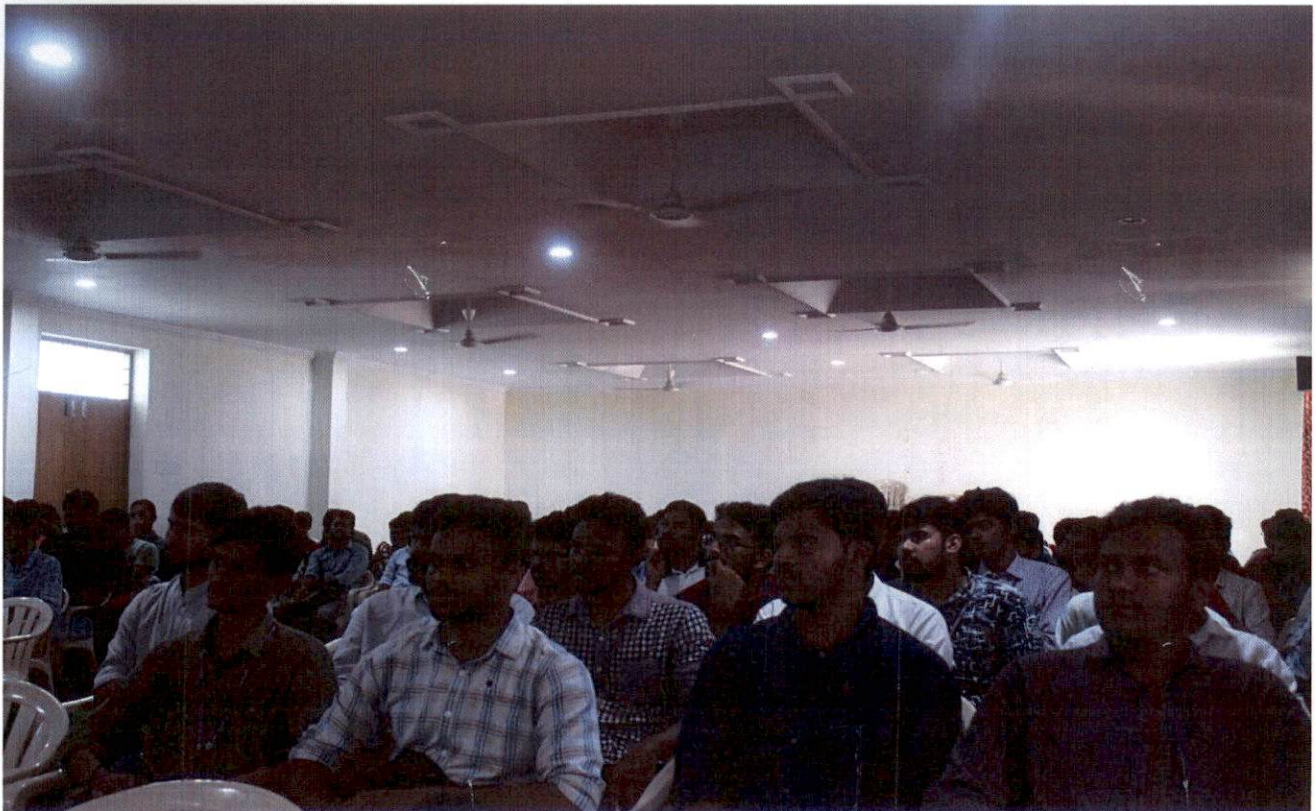
Celebrations of Babu Jagjivan Ram Jayanti on 05/04/2018